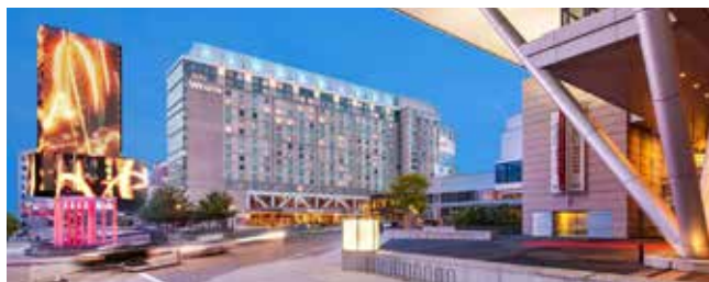
Westin Boston Seaport District 425 Summer St. Boston, MA 02210

Explore the city or enjoy an evening of relaxation at our hotel located two blocks from the Boston waterfront. From the Seaport District, go for a stroll or take a water taxi to attractions such as the Tea Party Ships and Museum, Boston Children's Museum, or New England Aquarium.